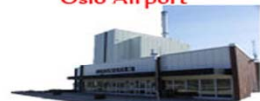
Nuclear Power Plant